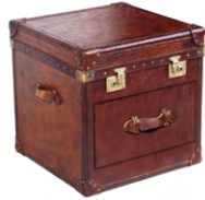
Ampleforth Large Side Table L: 23.2" / 59 cm W: 23.2" / 59 cm H: 23.4" / 59.5 cm