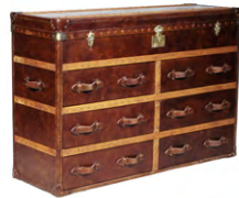
Ampleforth Sideboard L: 59.1" / 150 cm W: 19.7" / 50 cm H: 40.2" / 102 cm