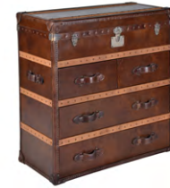
Ampleforth Medium Chest L: 39.4" / 100 cm W: 19.7" / 50 cm H: 40.2" / 102 cm