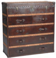
Ampleforth Large Chest L: 47.2" / 120 cm W: 19.7" / 50 cm H: 49.8" / 126.5 cm