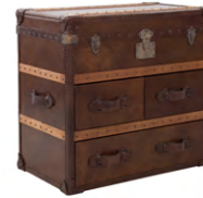
Ampleforth Small Chest L: 31.5" / 80 cm W: 19.7" / 50 cm H: 30.5" / 77.5 cm