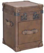
Ampleforth Small Side Table L: 16.1" / 41 cm W: 16.3" / 41.5 cm H: 22.2" / 56.5 cm